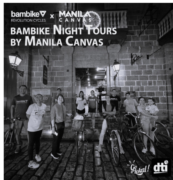
Experience Intramuros' Nightscape with Bambike Night Tours by Manila Canvas

Pedal through Intramuros' illuminated streets and appreciate Manila's heritage sites with Bambike Night Tours by Manila Canvas.