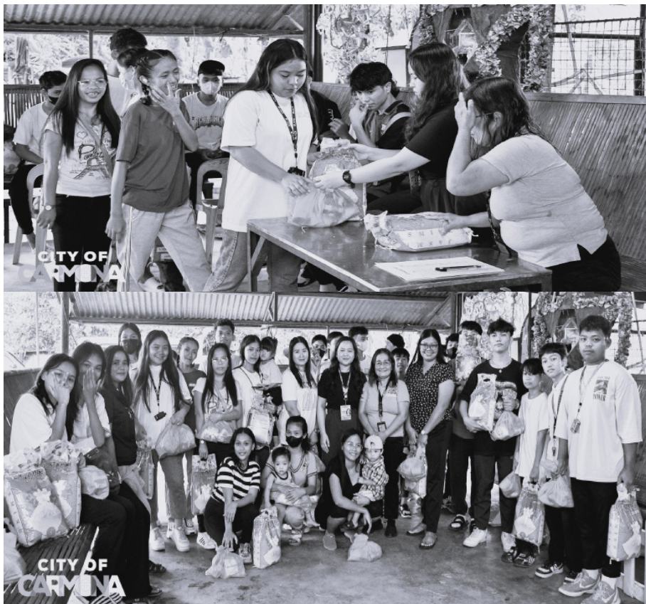
(Turn to page 13)

Namahagi ang Pamahalaang Lungsod ng Carmona, sa pangunguna ng Office of the City Mayor ng sagip tulong para sa mga learners ng Alternative Learning System o ALS mula Barangay Bancal. Sana po ay makatulong ang mga munting handog na ito para sa inyong mga pangangailangan sa araw-araw. Nais namin ang patuloy ninuyong tagumpay at asahan niyo po na lagi kaming nakaagapay sa pag-abot ng inyong mga pangarap.