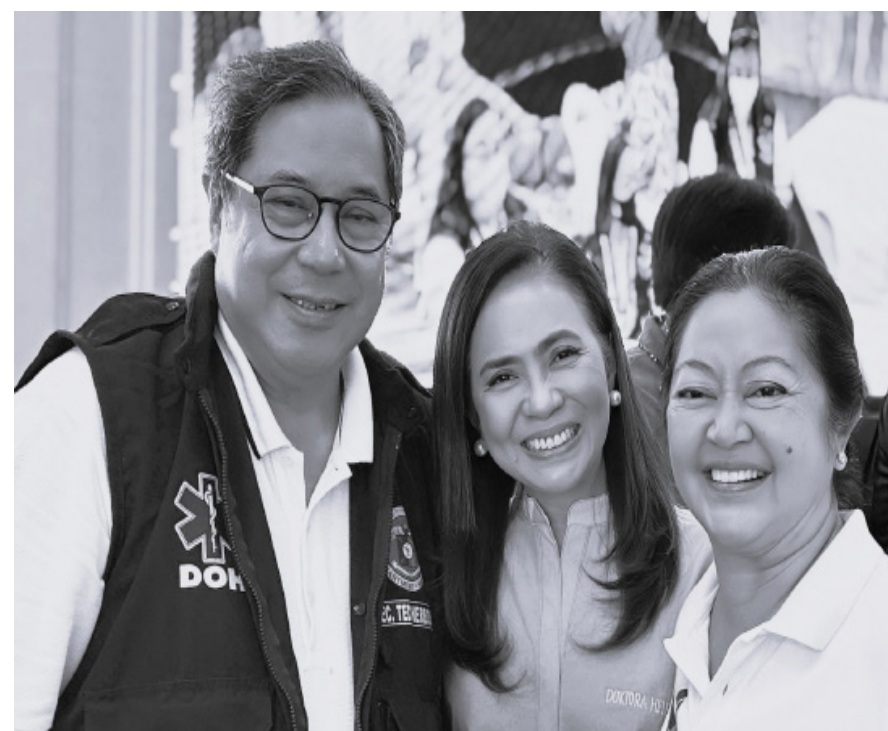
Patuloy na nagpakita of Health (DOH) sa paglunang suporta ang Department lunsad ng pamahalaan ng programang LAB for ALL Caravan sa Quezon Convention Center sa Lucena, Quezon ngayong araw, ika-9 ng Enero, 2024.